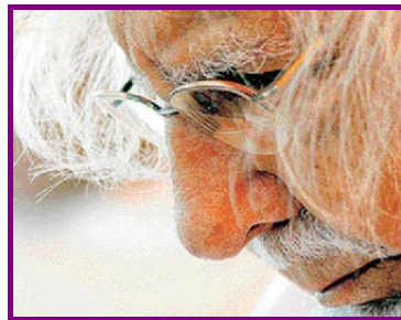
by Ernesto Cardenal

When its your turn, to talk into the microphone, when the TV cameras focus on you, think about the ones who died.