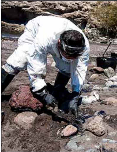
A man collects fuel oil from rocks in April 2015 following an oil spill along Veneguera beach in Spain's Canary Islands.

3. Why does Francis think it is important for us to understand ecosystems and our relationship