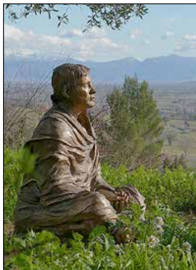
A statue of St. Francis looks out over Assisi, Italy.

* http://w2.vatican.va/content/francesco/en/encyclicals/documents/papa-francesco_20150524_enciclica-laudato-si.html