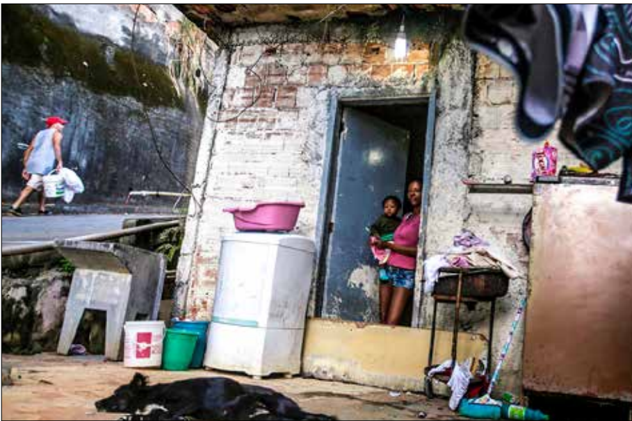
A woman holds her child at the entrance of her house in a slum area of Rio de Janeiro in April 2013.

10. What does Francis see as the positive and negative aspects of biological technologies (130-136)?