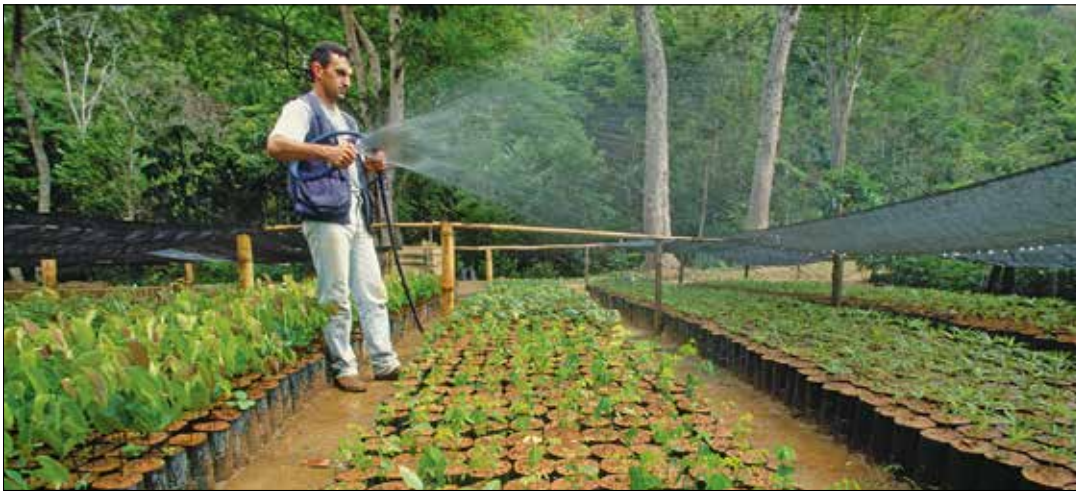
A reforestation nursery in Montes Claros, Brazil

One of the many marvelous things about Pope Francis' encyclical on the environment, " Laudato Si', on Care for Our Common Home ," is that it is written in a very accessible style. It does not read like an academic tome as have many encyclicals of the past. Anyone who can read a newspaper can read this encyclical and get something out of it.