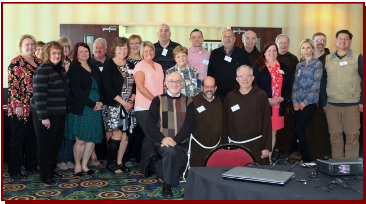
Participants of the NAPCC Development Conference