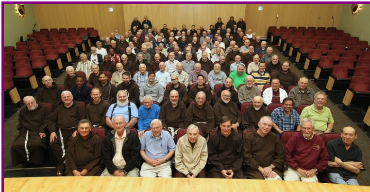
2014 Provincial Chapter, St. Xavier University, Chicago

Coming soon: 45 th Chapter of the St. Joseph Province