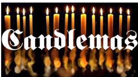
Candlemas: 2 February